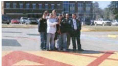
Augusta brothers display their letters.