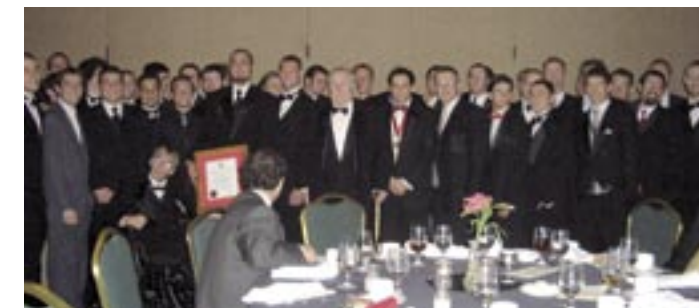
West Georgia celebrates at their Chartering Banquet, April 30th, 2005.

Our goal for chartering has finally been accomplished. We now turn our sights onto other goals such as stronger recruitment, winning a challenge cup through intramurals and more involved philanthropy and community service programs.