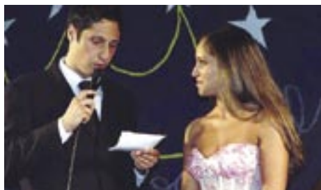
Binghamton's Miss Aphrodite beauty contest.

Our philanthropic events were second to none, as we helped raise $880 at Relay for Life to help fight cancer. We also started a new Delta Chi tradition by hosting “Miss Aphrodite,” a beauty pageant featuring women from many different sororities and professional fraternities. This event, which sold out, helped raise money for the University’s preschool to build a garden near the new playground. We also participated in our first ever Greek Week since we were formally recognized by the IFC. This included participating in events such as bowling, dodge ball, displaying our letters all over campus, and other events involving all Greek organizations. We are also active on the intramural scene, especially in our favorite sport: softball.