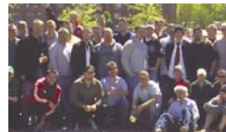
Northeast Missouri brothers on site of new house.

On April 23rd, during our annual Alumni Reunion, we watched as our old house was bulldozed to make room for our new house.