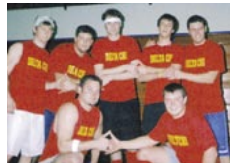
Tarleton's basketball team.

We participated in the Tarleton Round-up, helping and doing favors for the community residents and businesses. Spring brought our philanthropy with the ladies of Alpha Gamma Delta, in which we hold an Easter egg hunt benefiting the local foster home. Several