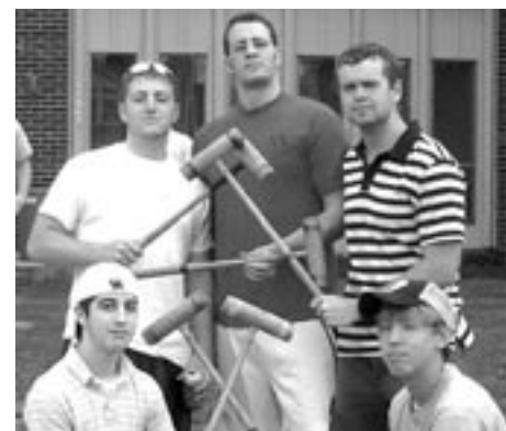
Miami brothers "letter" in croquet.

We are happy to report that we kicked off 2005 by contributing more total hours of community service in one semester than we have ever recorded with over 357 hours of community service this spring, compared to 106 hours during the fall, and 52 hours a year ago. In addition to these outstanding efforts made by our members, we also organized a very successful philanthropy to raise funds for the tsunami relief efforts. By placing change jars next to the registers at local businesses, we were able to generate over $1,400, which will go to help those whose lives were affected by that tragedy.