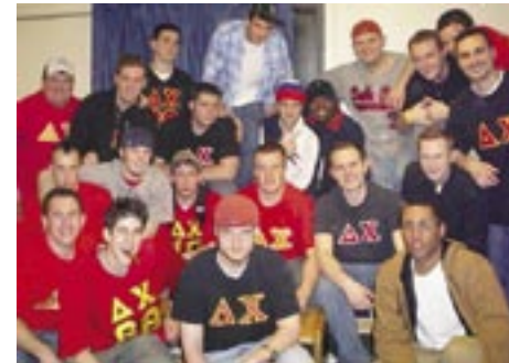
Bryant brothers pose for the camera.