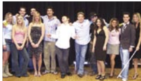
Northwest Missouri Date Auction.