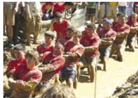
Georgia Tech brothers participate in mud tug-of-war.

brotherhood retreat 15 years ago. Hiking, relaxing, and an Alumni-Undergrad football game highlighted the retreat.