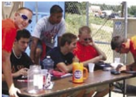
Northern Colorado brothers at the front gate of the Make-A-Wish Rally.

On July 10th our chapter and the LaSalle Eagles, also a non-profit organization, teamed up to raise money for The Make A Wish Foundation. This is a high profile foundation that helps kids. They grant "one last wish" for terminally ill children. On July 10th, we hosted an event that included local radio stations, and two live bands. There were also a few vendors that helped raise money from the sales that they made that day. We helped raise over $4,500.