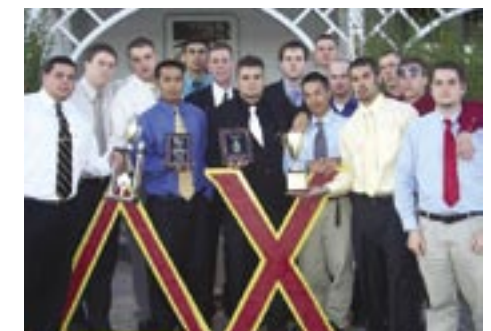
Radford brothers show off their awards.

This spring, we took it all. At the Greek Week awards ceremony on campus, the entire Greek Life community was present. Our chapter had been present at all events throughout the week and participated at a level that was unmatched by any other organization on our campus.