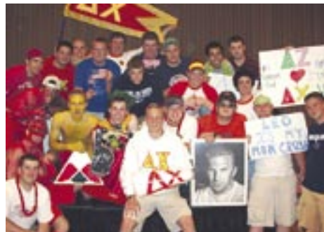
Bowling Green brothers at Greek God Contest.

Our social activities were highlighted by our Winter Wonderland with the beautiful ladies of Kappa Kappa Gamma and our annual formal at Put-in-Bay, Ohio. The boat ride over was very stormy and quite an adventure in itself.