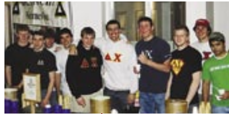
Appalachian State brothers at Teacher Appreciation Day.

For Greek Week we celebrated our 1st place victories during softball and lip sync. Our success in these and other events helped to bolster our brotherhood.