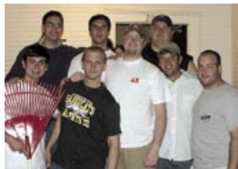
Louisiana Tech Seniors.