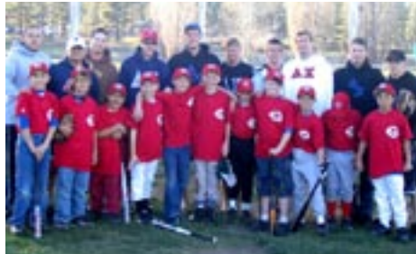
Brothers with the Flagstaff Reds Little League baseball team

ments should be completed by the end of the summer and will definitely help out in our recruitment.