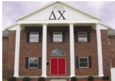
Southwest Missouri's new house.